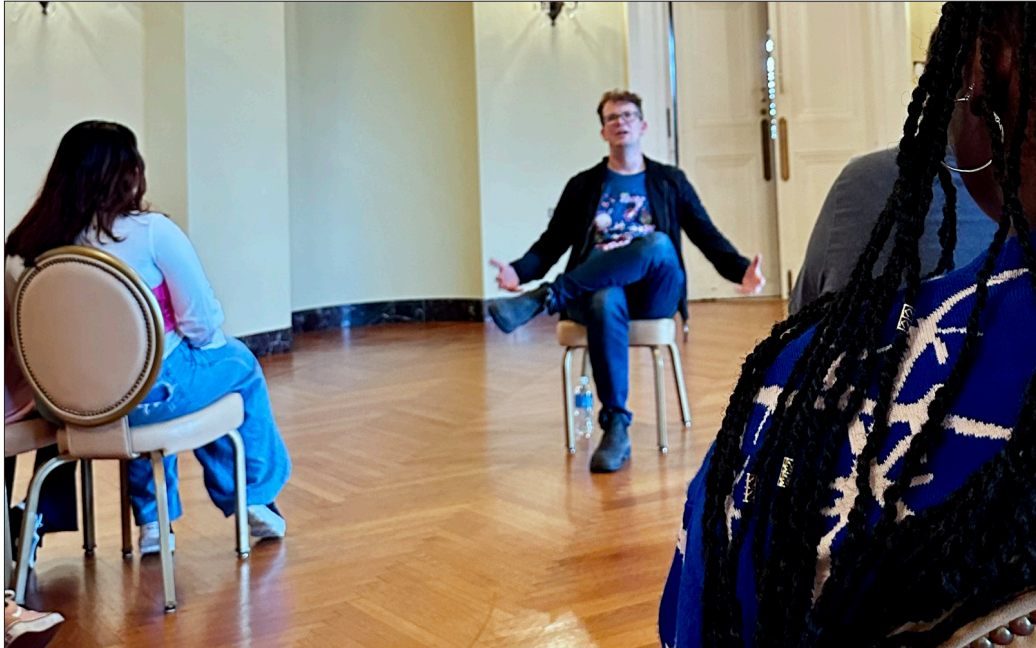
Hank Green's visit to YSU included a student Q&A session.