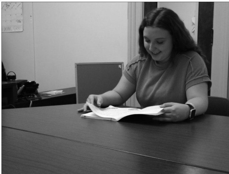
Honors students come to Fok Hall to write in their pen pal journals.

Honors students interested in joining the program can email Laudermilt at lrlaudermilt@student.ysu.edu .