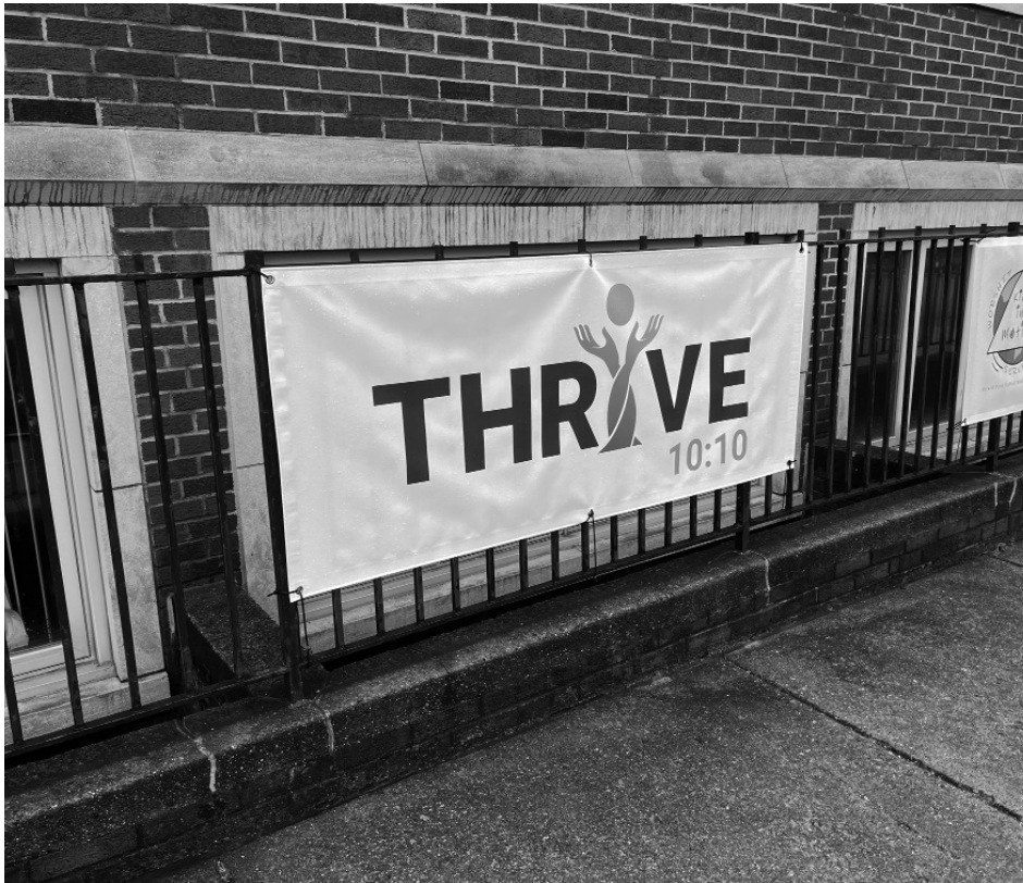
Thrive 10:10 welcomes donations to Ruth’s Boutique.

Those interested in learning more or volunteering for Thrive 10:10 can visit their website, thriveneighbors.org .