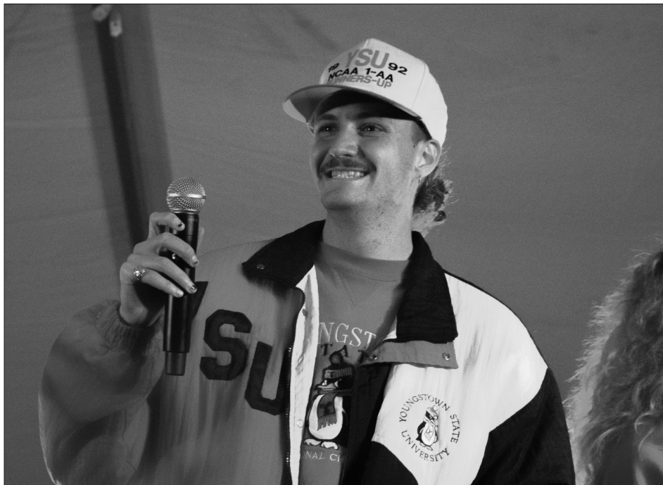
This year's Fall Fire Fest will take place in the M71 lot.