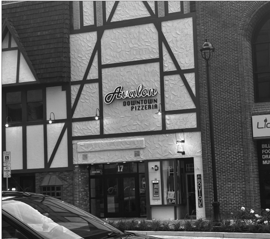
Local businesses offer discounts to YSU students.