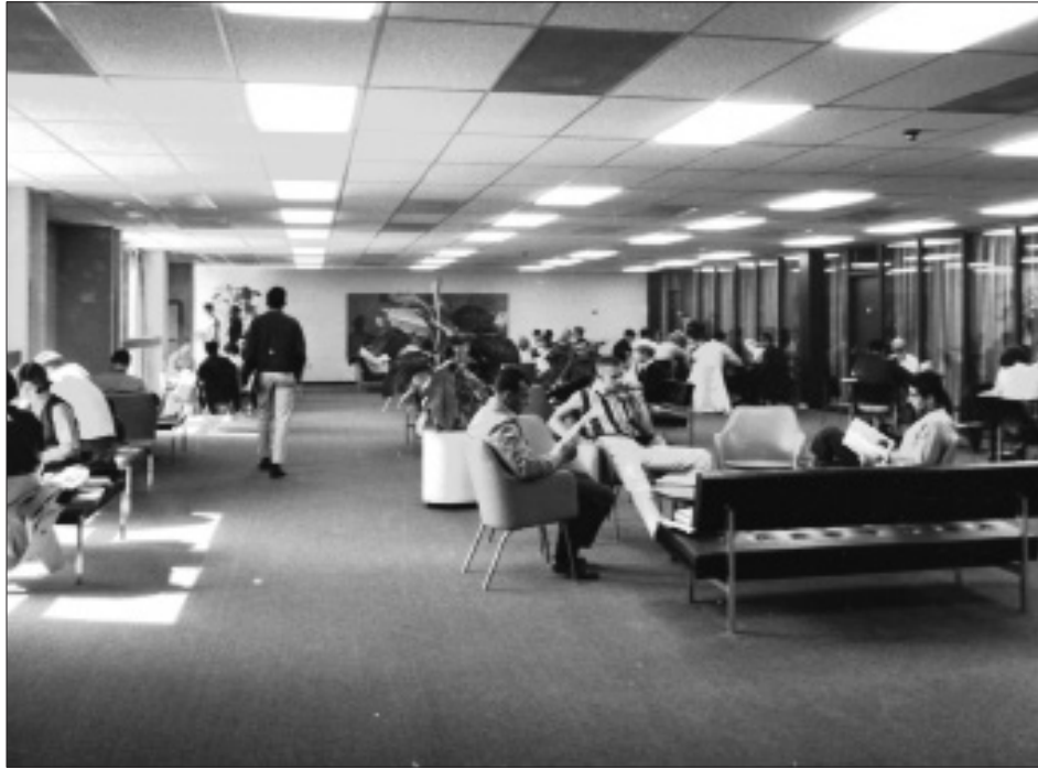
Archive photos of Kilcawley in the '70s.