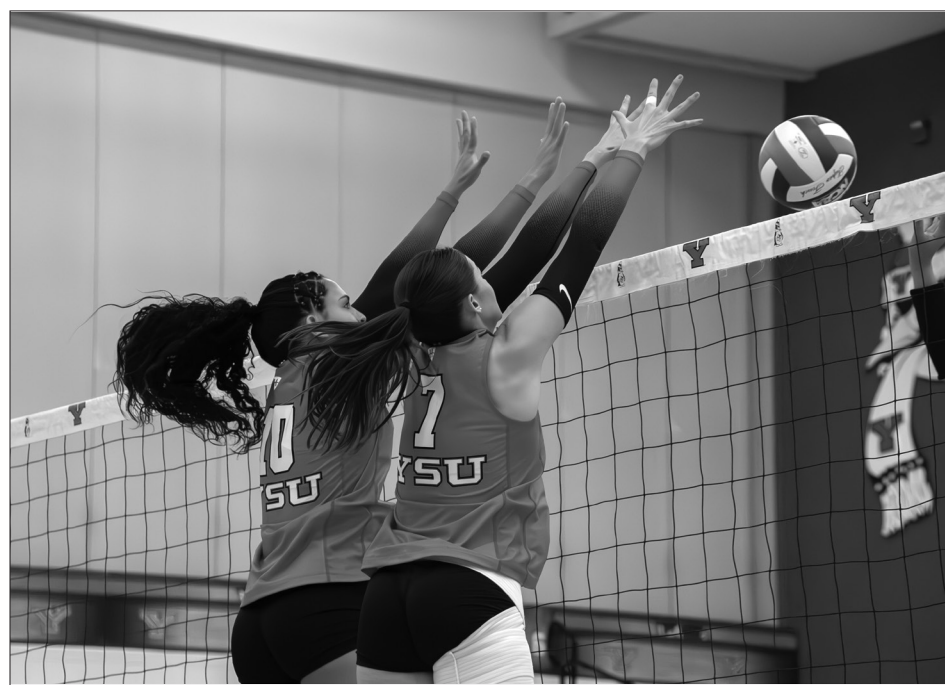
YSU looks to win at Northern Kentucky.