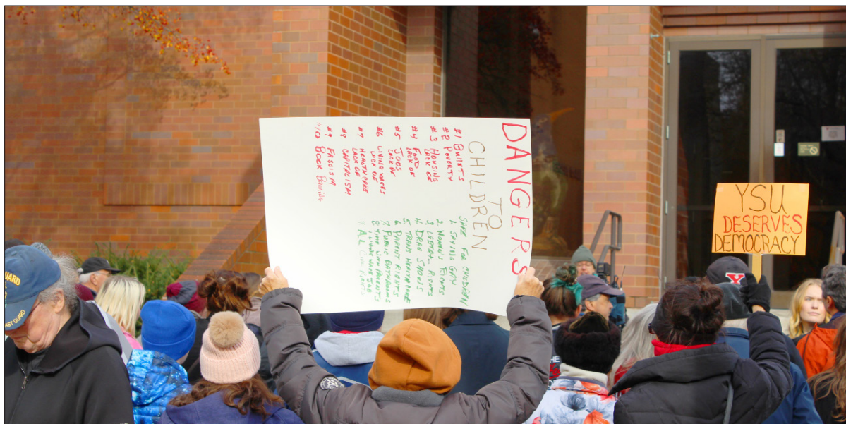
Freedom of speech is a fundamental right under the First Amendment.