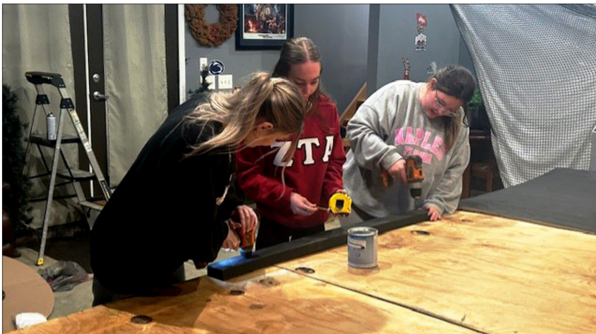
Members of Zeta pictured working on the float