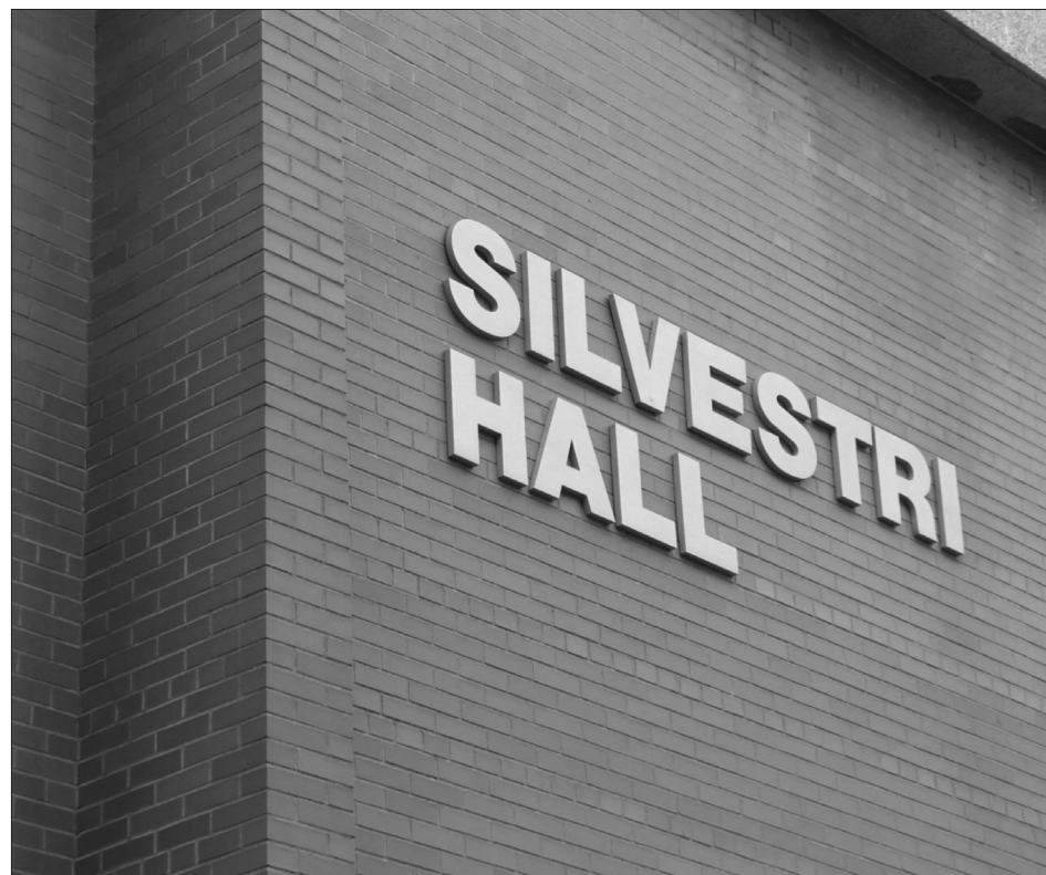
Academic advisors have offices in all department buildings.