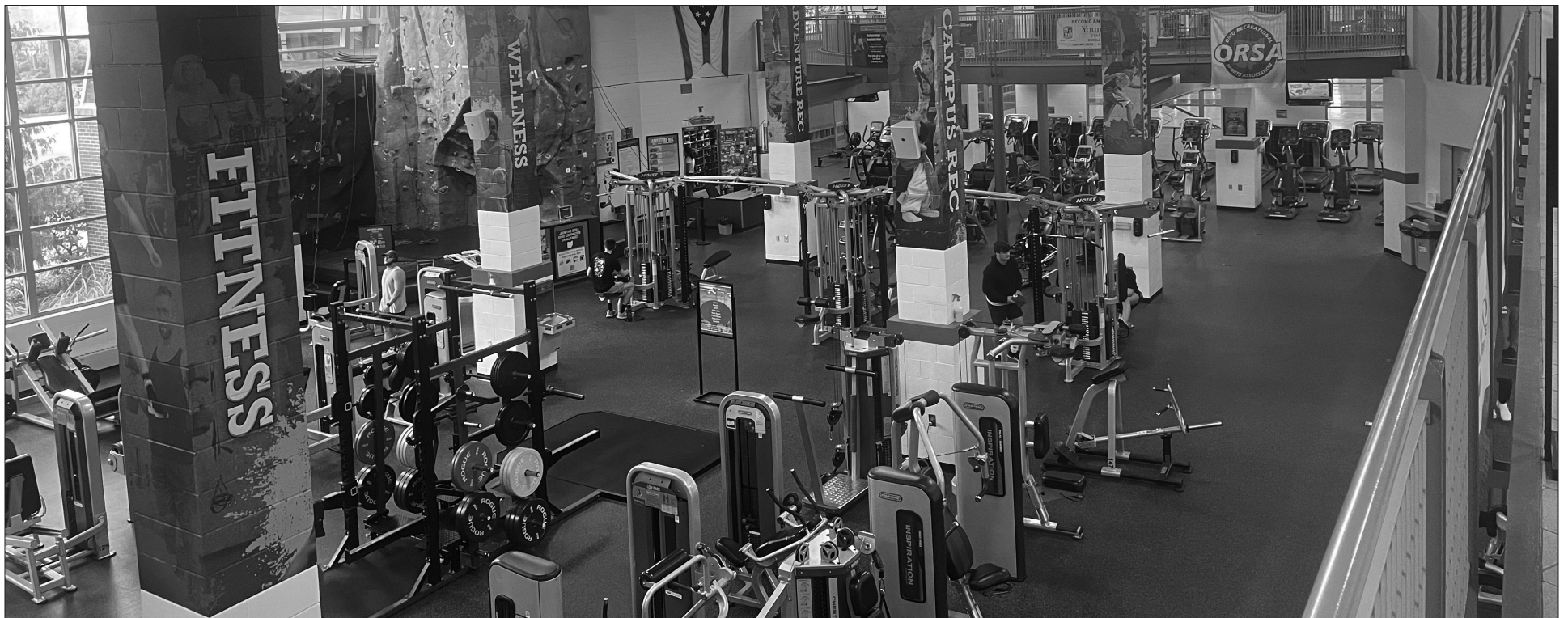
Campus Rec helps contribute to club sports funding.