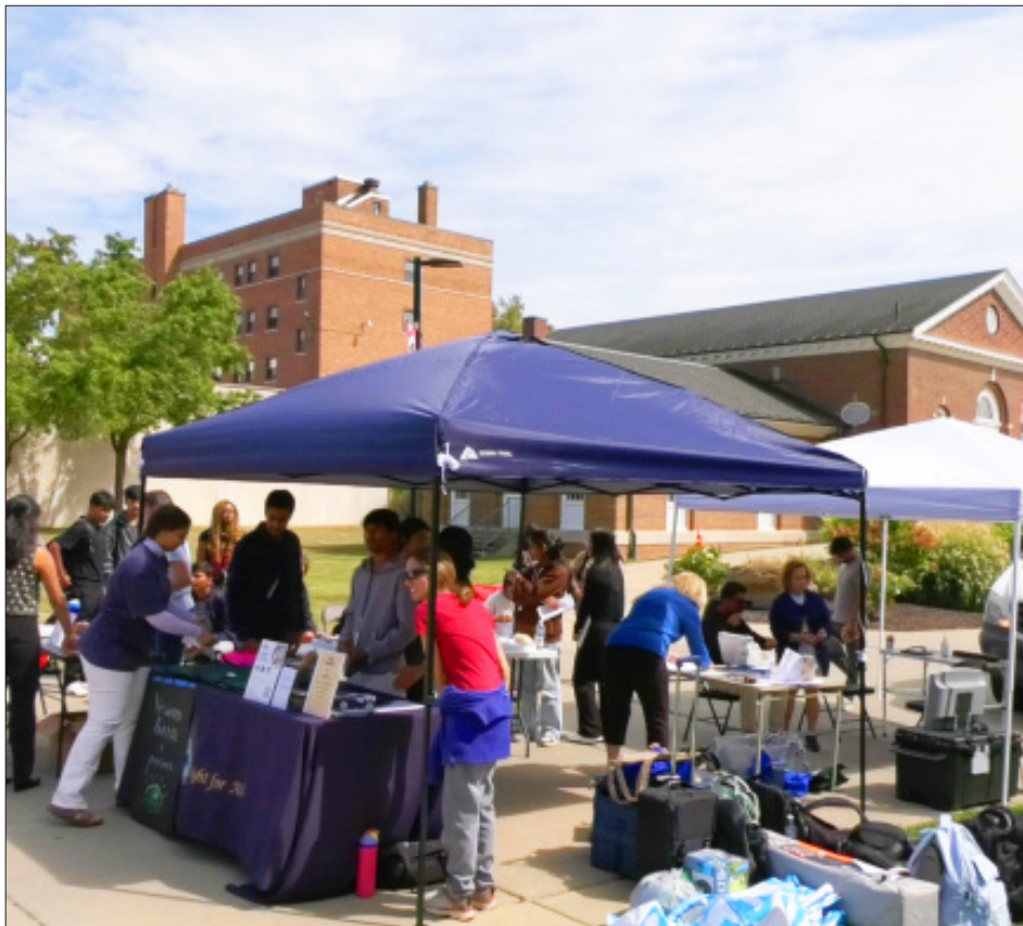
Students waiting in line for free screening.