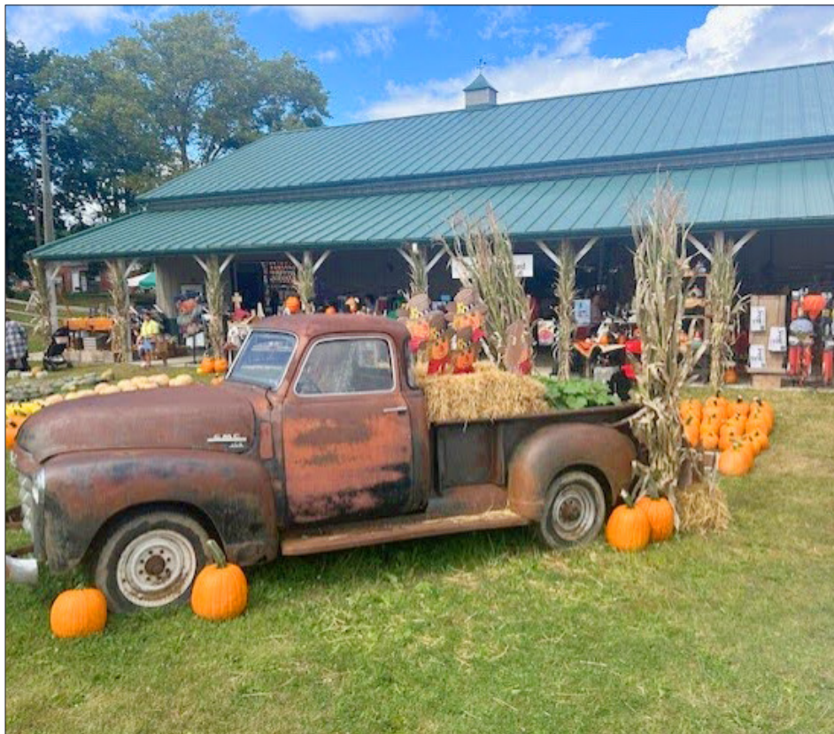
White House Fruit Farm sells fall themed decor.

Even as temperatures remain warm, don't miss out on all the fall fun at White House Farms, from now until Oct. 27.