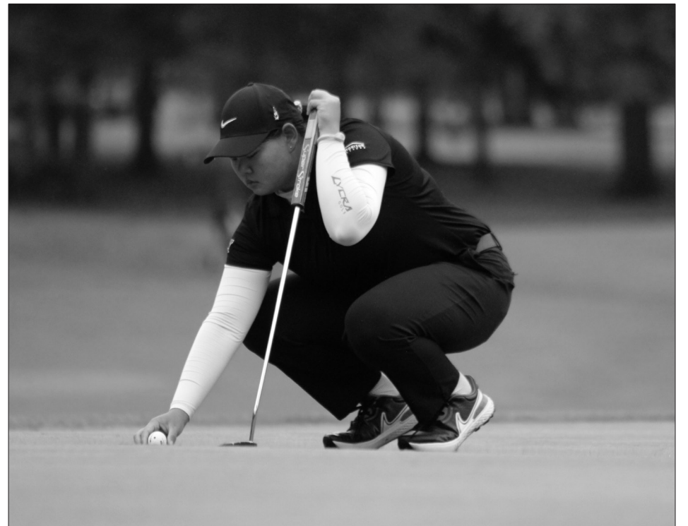
The women's golf team will travel to Indianapolis.

The Penguins will then travel to Indianapolis on Sept. 30 for the Butler Fall Invitational at Highland Golf & Country Club.