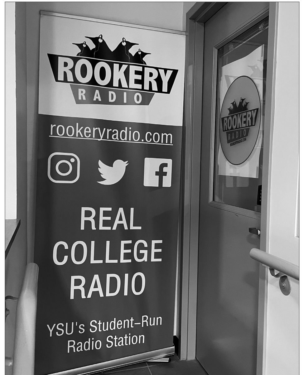
Rookery Radio features a variety of genres ranging from music to talk shows.