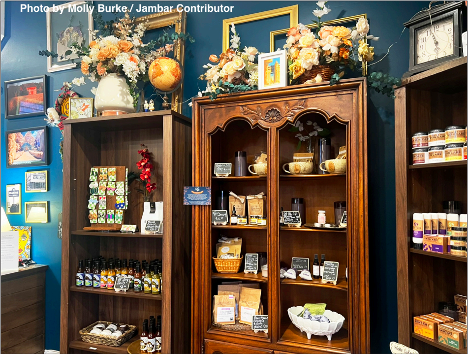
Guests can purchase beverages, pasties and merchandise at Juny Café.