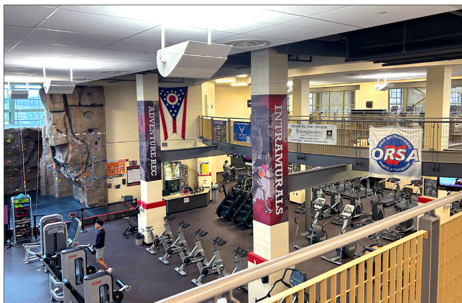
Members of the Rec can use treadmills, weights, workout machines, a rockwall and more.