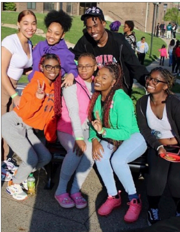
Members of BSU celebrating the end of the 2022-23 school year with a cookout.

Students can learn more about BSU through its Instagram @ysu.bsu or can attend its weekly Wednesday meetings at 6 p.m. in the Lariccia Room in Jones Hall.