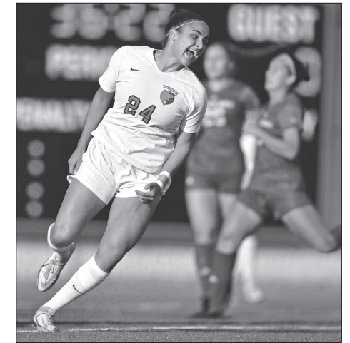
Track & field, women's soccer and men's basketball all contributed points to the McCafferty Trophy.