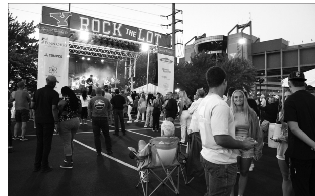
Rock the Lot happened Aug. 29.

For more information on Youngstown State’s football team, visit its website.