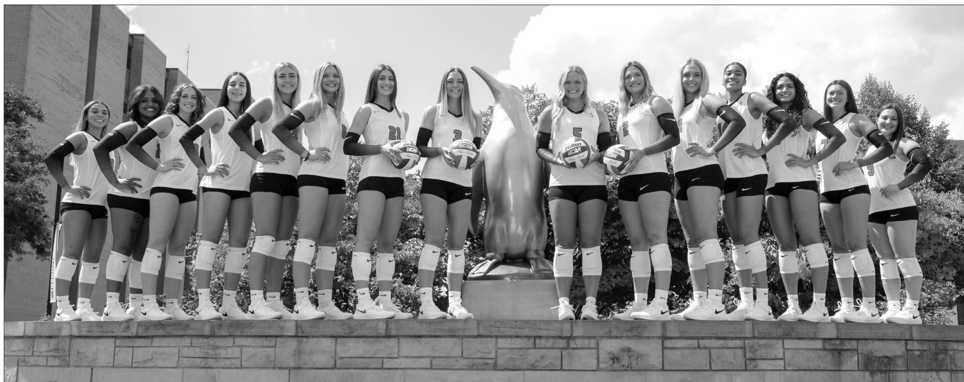
YSU Women's Volleyball Team's performance stood out in the games high leaderboard.

To watch the game check out ESPN+ and for stats, highlights and more visit ysusports.com .