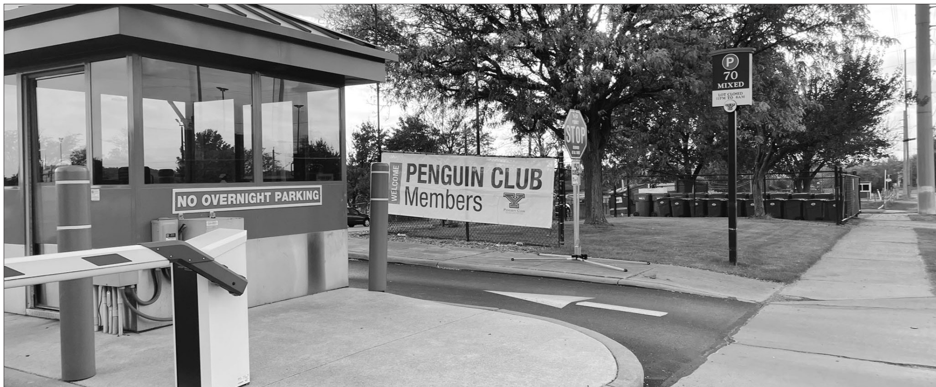
The M70 parking lot is located across from Stambaugh Stadium.

Contact 330-941-1515 for student security services, which are available 7 a.m. to 11 p.m. Monday through Friday.