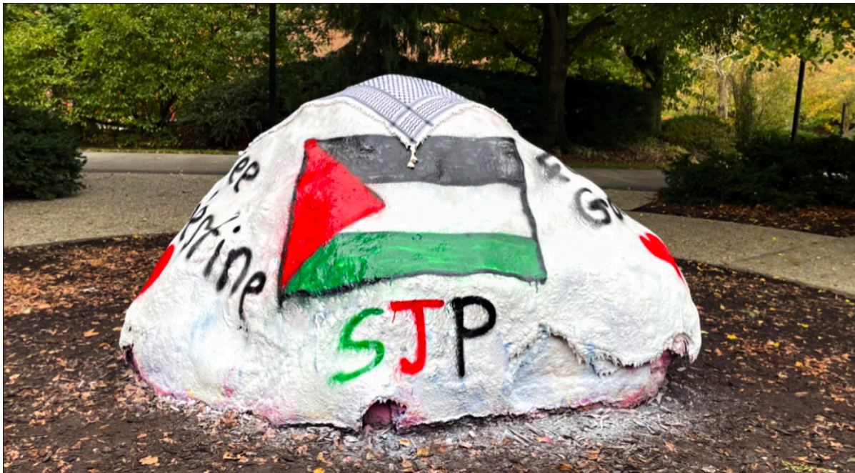
The rock was painted by the Students for Justice in Palestine.