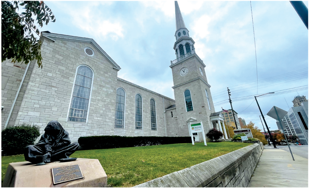
First Presbyterian Church acts as a polling place.