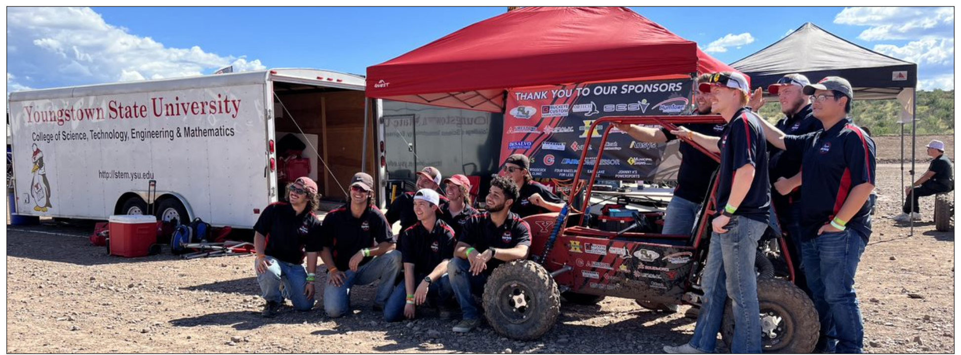
The Baja Racing Team in Greenville, Arizona.