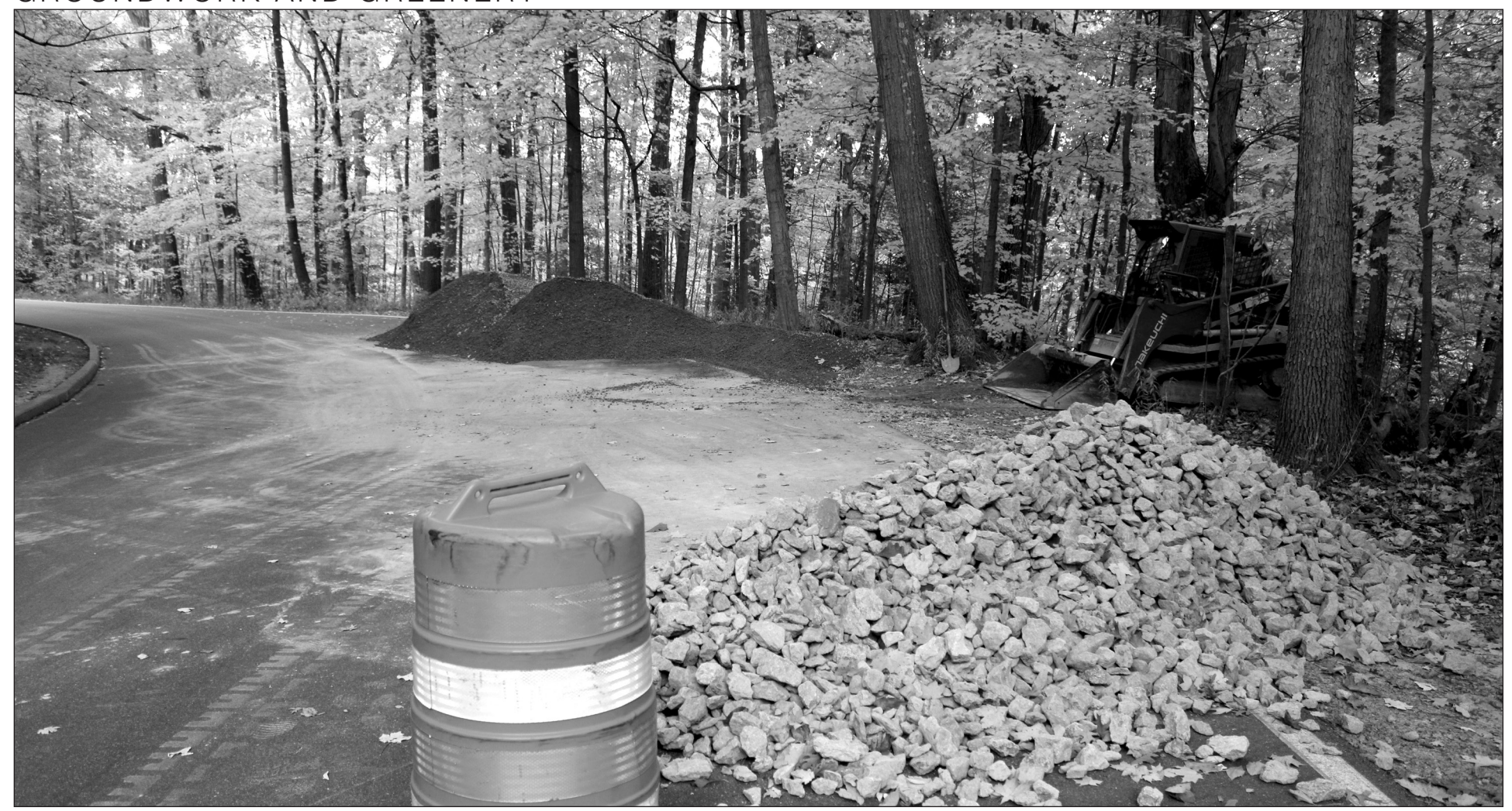
Trails will receive restorations and improvements for hikers.