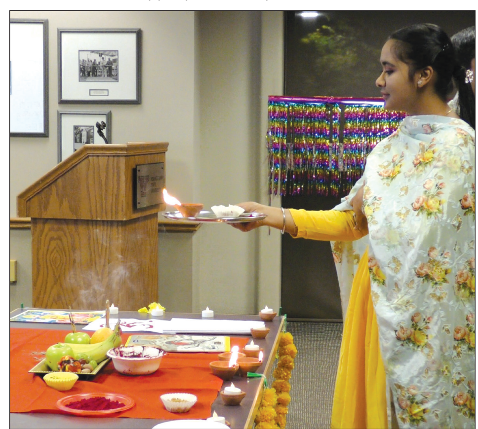
YSU students celebrate Diwali.

Diwali celebrations vary yearly as the holiday is based on the lunar calendar. Next year's Diwali is scheduled for Nov. 12 to Nov. 16.