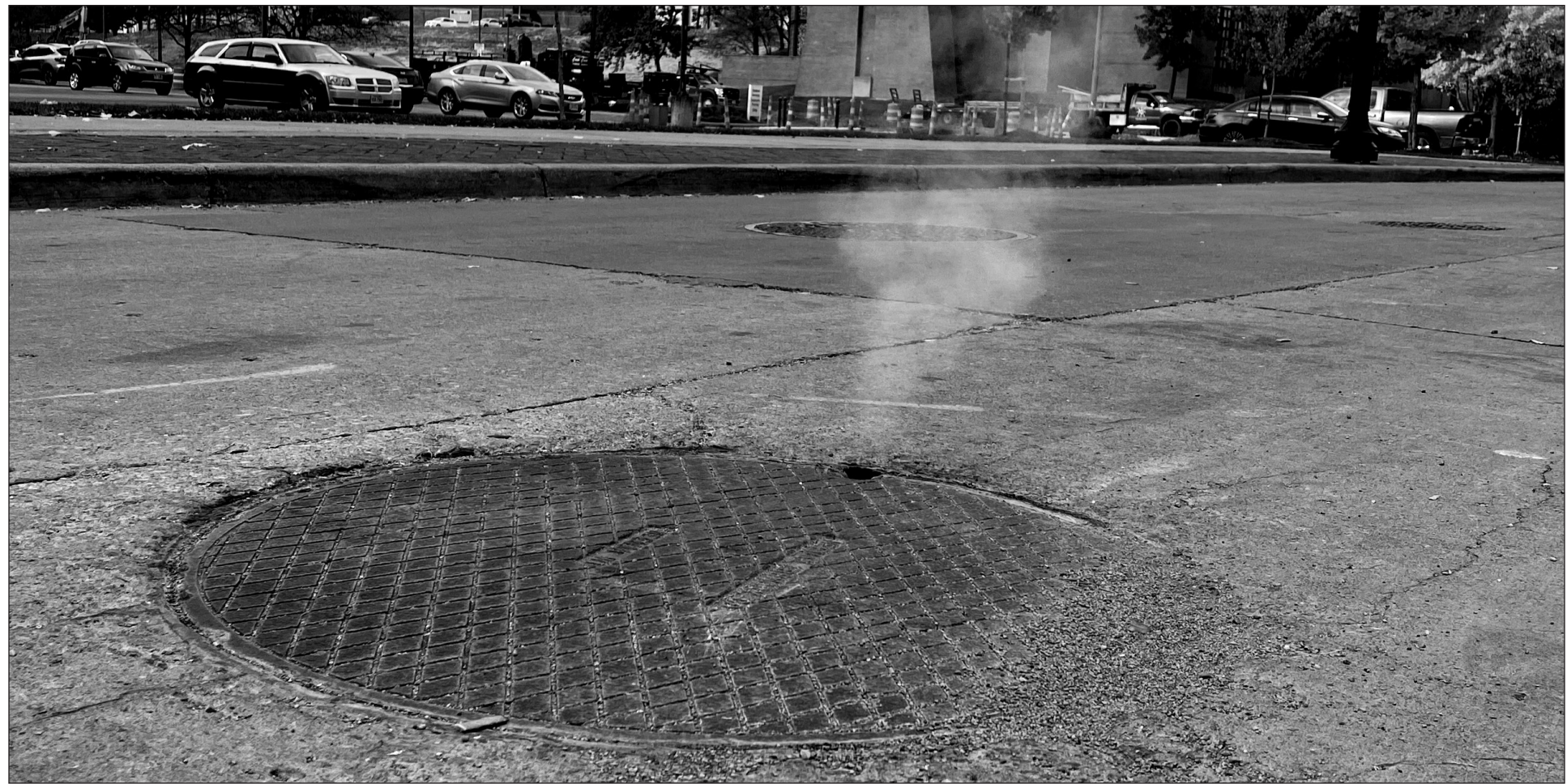
Steaming manhole in downtown Youngstown.

"It's certain times of the year, usually when we haven't had a lot of rain, you start smelling it. When we have rain, it dilutes the sanitary sewage and washes out the pipes to a certain degree," Hyden said. "What can be done about it? I'm not sure — short of repiping Youngstown — that you're going to solve [the smell]."