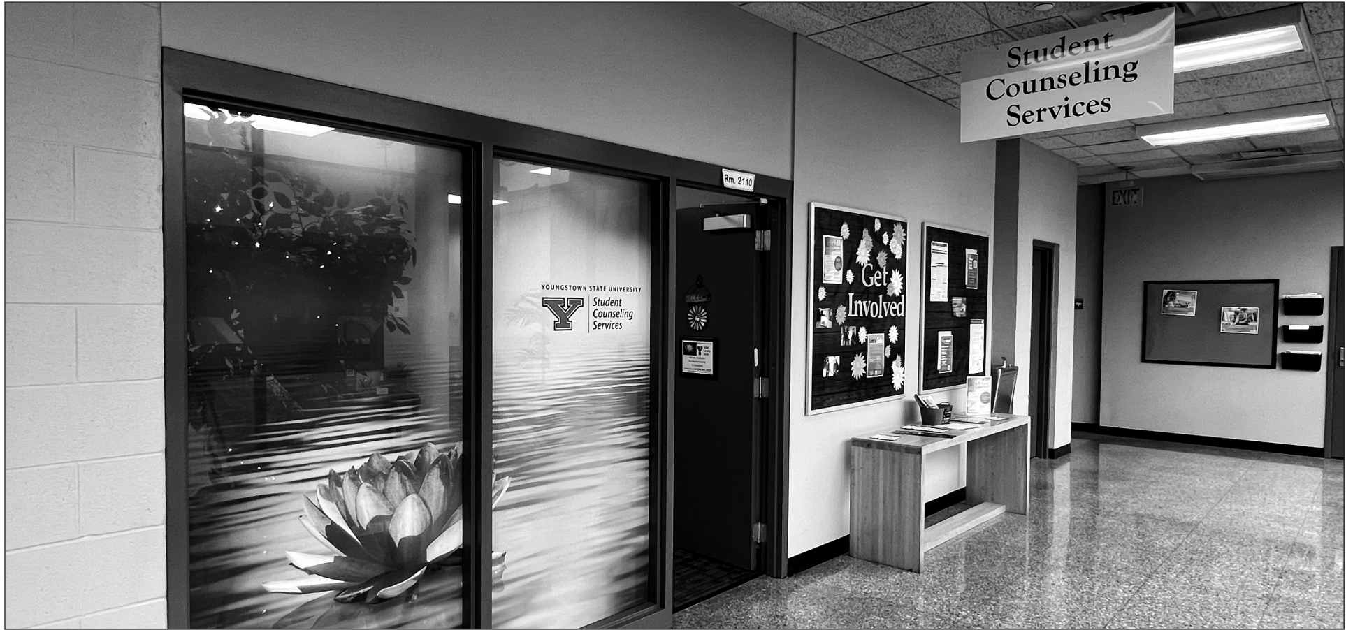
Student counseling services are located in room 2110 of Kilcawley Center.

The Student Counseling Services are located on the second floor of Kilcawley Center in room 2110. For more information, visit the Student Counseling Services website.