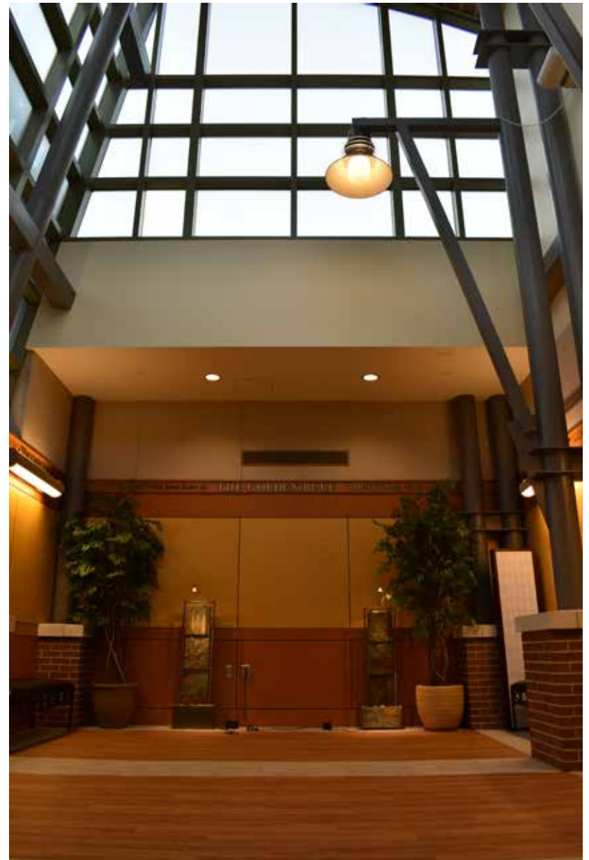
The Andrews Rec Center meditation room gives students a quiet and peaceful place for prayer or meditation needs.

“I just think it would be better if domestic students hung