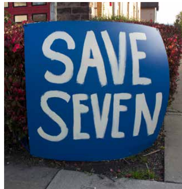
A lone sign sits in front of Station 7 on Elm Street.