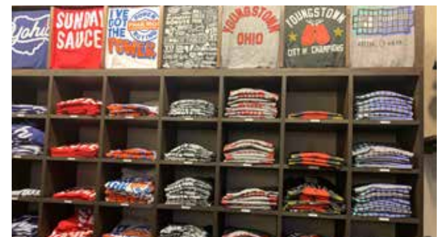
A small collection of shirts Youngstown Clothing Company offers at its brand new retail space in the Southern Park Mall.

The renovations are estimated to be complete by fall 2020.