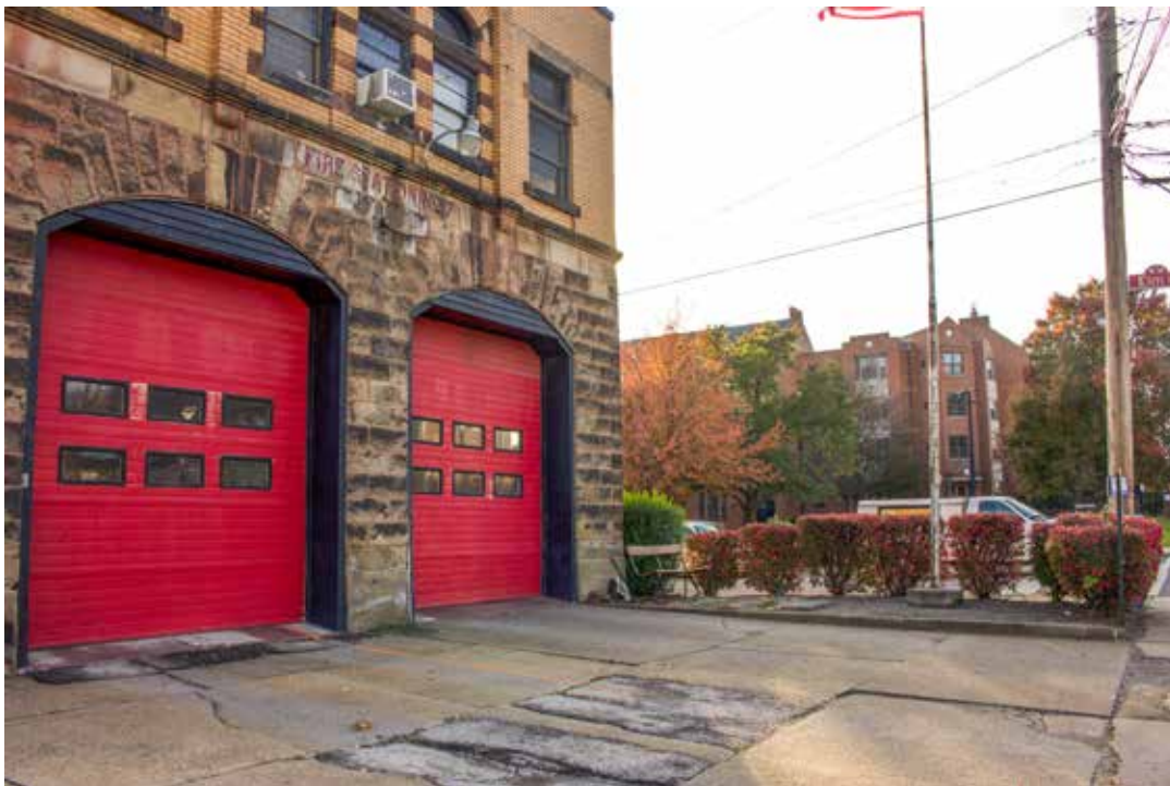
Youngstown's Fire Station 7 has been serving the Youngstown area for 116 years.