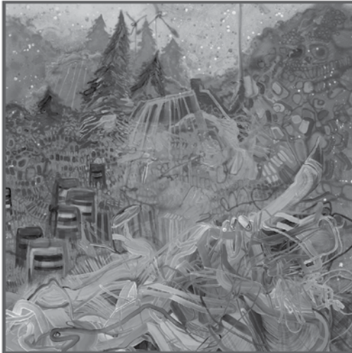
DANA OLDFATHER Out of the Woods Into the Weeds