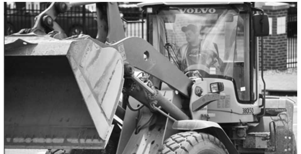
Construction workers work to finish the Fifth Avenue waterline replacement project.