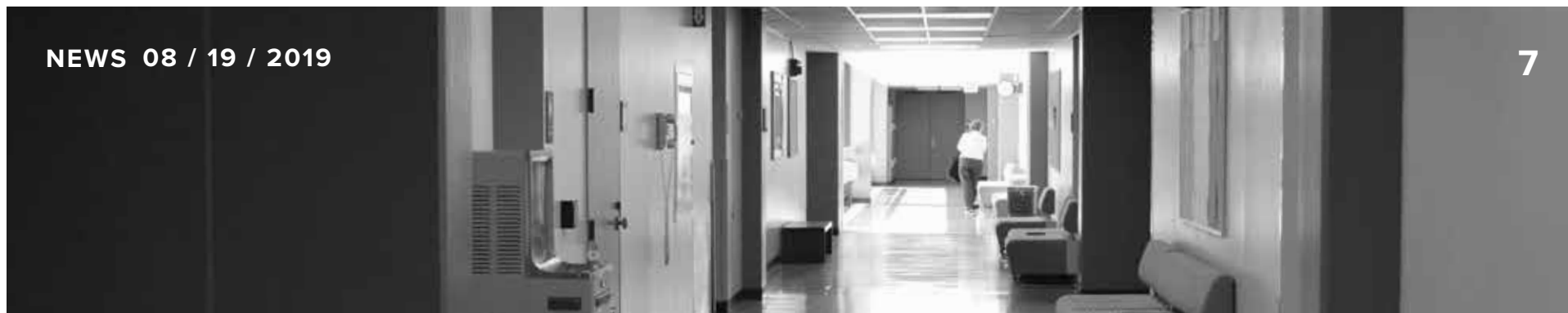
Bliss Hall looks a little different after renovations that occurred over the summer.