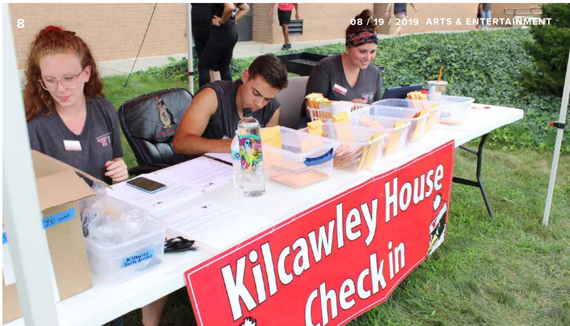
Youngstown State University students prepare for the fall semester with Welcome Week activities.