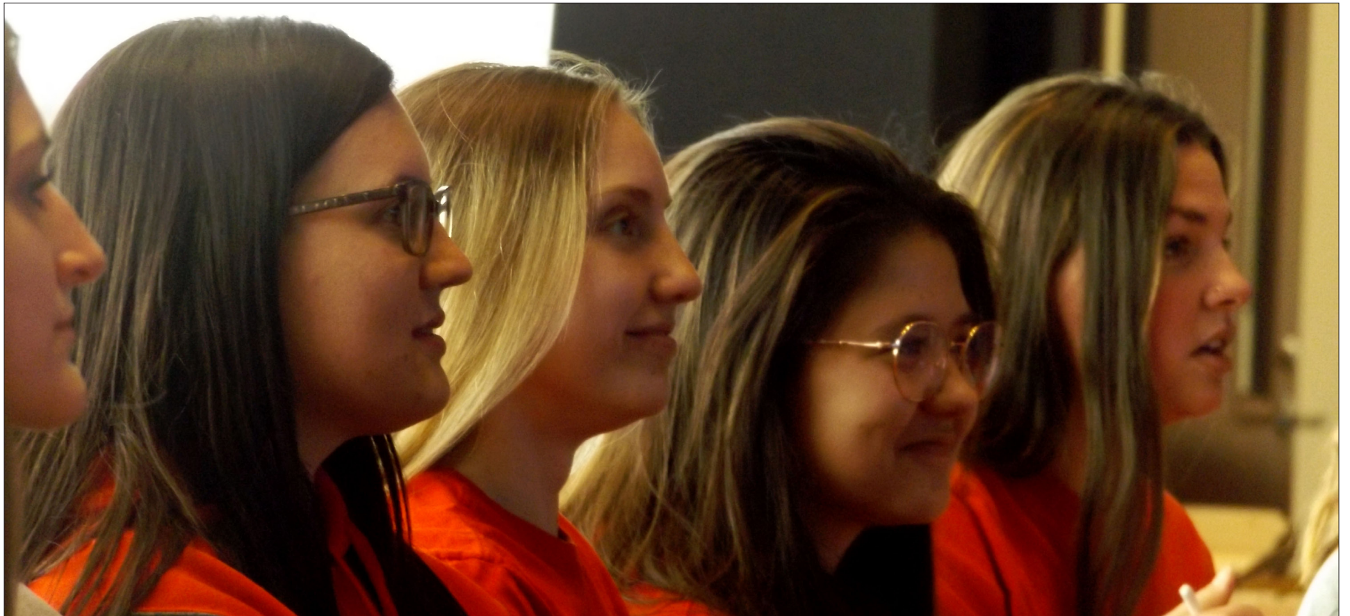
Women's bowling places second in Southland Bowling League Championship.

Stay up to date on scores and stats on ysusports.com