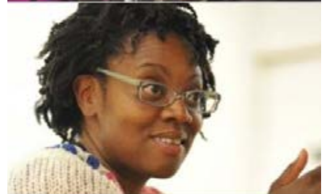
Cauleen Smith's art pieces reflect on the possibilities of imagination.