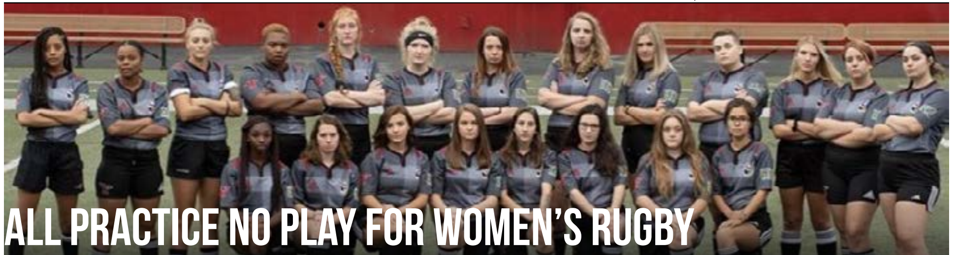
Members of the YSU women's rugby team pose during their pre-pandemic play.