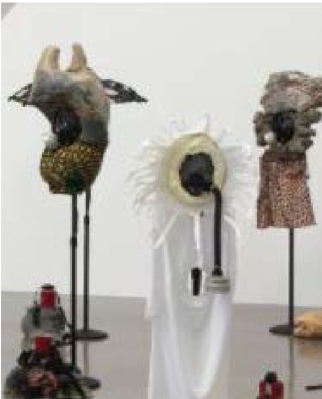
Kevin Beasleys' art pieces are made from found materials and clothing, and reflect the bodies that may have once inhabited them.