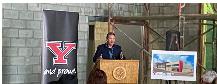
Lt. Gov. John Husted visited Youngstown following an investment of $12 million into Mahoning County through the creation of the YSU Energy Storage Innovation and Training Center.