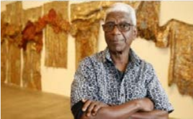
El Anatsui's art pieces use discarded items such as liquor bottle caps, printing plates and cassava graters.